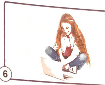
6 Sue .....

14 Look at activity 13, think and complete.